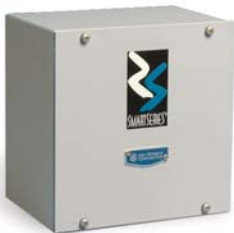
Indoor Speaker Amplifier