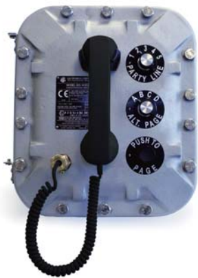
Outdoor and Explosionproof Station